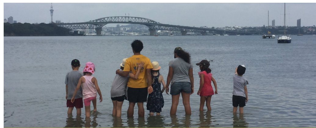
KIDS AT #134 HOLIDAY PROGRAMME