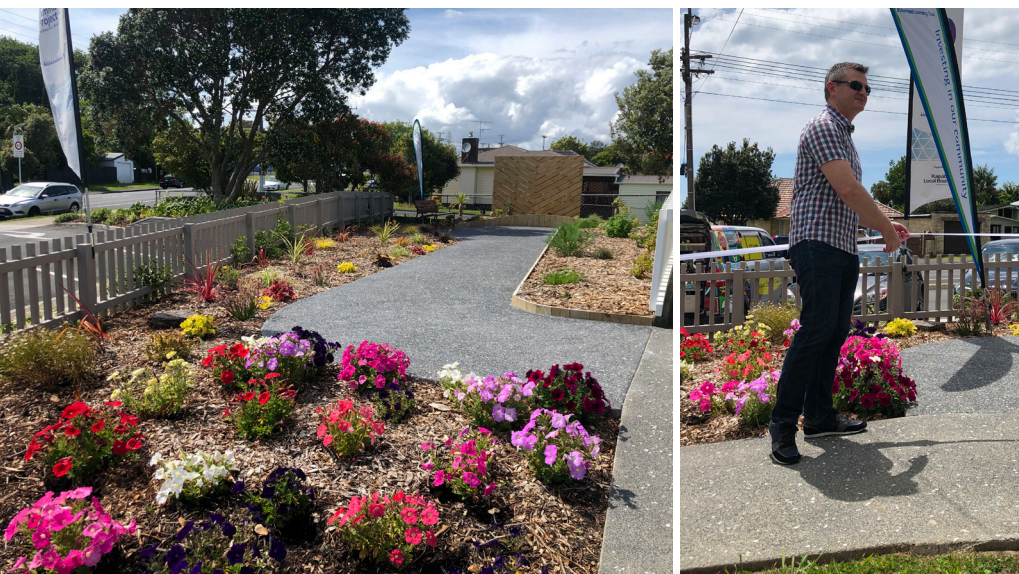
BIRKDALE SENSORY GARDEN

In partnership with Haumaru Housing, it is a pleasure to offer the 60+ community opportunities to socialise though Kai, entertainment and connections.