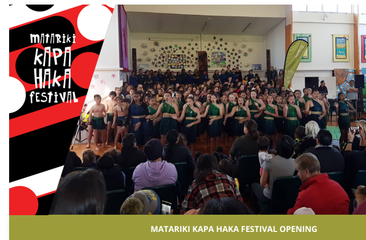
MATARIKI KAPA HAKA FESTIVAL OPENING

We have developed an events calendar to ensure we are providing high class, relevant and well attended events that fit our strategic vision.