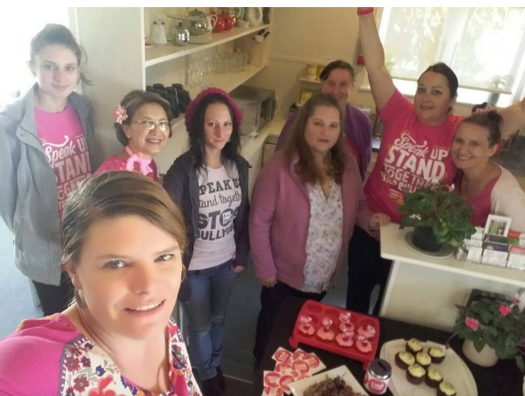
BBCP SPEAK UP MORNING TEA