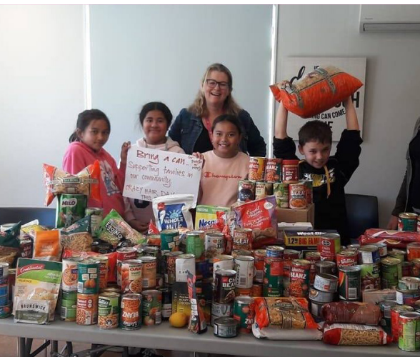
BEACH HAVEN PRIMARY - DONATIONS TO COMMUNITY EATS FROM THE CRAZY HAIR DAY

A place where people gift food and where people take food. It's a simple concept; GIVE | TAKE | RESPECT | BE KIND.